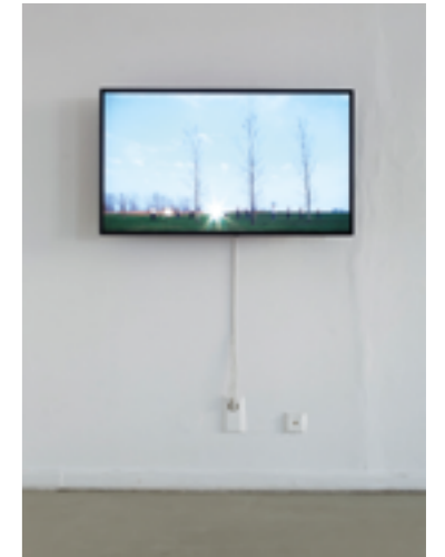
video monitor Kunstverein Tiergarten, Berlin, 2012

The work was realized in Northerly Island Park, in Chicago. In this location just a few years prior were the grounds of Meigs Field, an airport which was dismantled by the authorities in a single night. I invited twelve people who didn't know each other, to take a walk together, in the same direction, each holding a piece of mirror. A camera recorded the group walking. As the rays of the sun were reflected by the mirrors, the movement and rhythm of each person were accentuated. The reflected light referred to some kind of code from a group whose faces were only vaguely discernible.